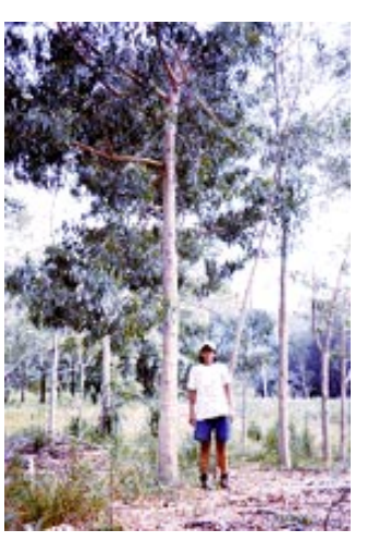
Figure 5. Selected five year old koa tree from Maunawili, Oahu.

Thinning of koa stands up to 15 years will result in low value wood only. Commercial thinning of wood with color and figure may occur after 15 years. However, as silvicultural systems are developed for koa, it is likely that pre-com-